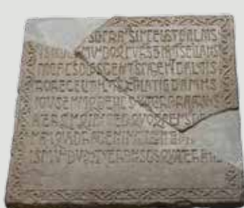
) Mozarabic epigraph (11 th century)

Cities such as Iliberris or Acci , despite retaining their status as capital cities, judicial administration