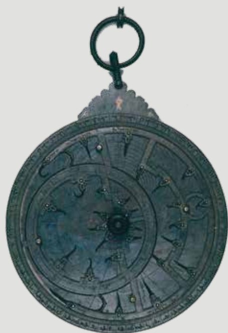
) Astrolabe of Ibn Zawal. Albaicín, Granada (1481)

towns (Arabic, Berber...) led to the formation of a strong State, the Umayyad, marked by the Koranic religion with a complex social structure based on ethnic ties. Andalusian art is characterised by symmetry, repetition of religious script and combinatorics, whose high artistic and scientific level is evidenced with green and manganese pieces of ceramic in Medina Elvira, the extraordinary Astrolabe of Ibn Zawal and the different types of columns and capitals from different periods and techniques. The Christian conquest of Granada in 1492 by the Catholic Monarchs put an end to this period, making way for the Modern Age.