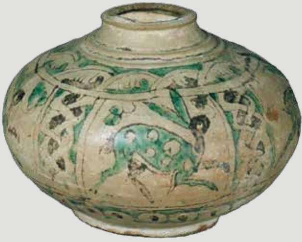
) Redoma de las liebres (carafe of the hares). Medina Elvira, Atarfe (10 th -11 th centuries)

The Islamic presence (711-1492) brought about a change in the settlement patterns: in the rural setting, with intensive irrigated agriculture; and in the urban setting, with the implementation of the medinas arranged into three areas: alcazaba (the residence of the State power), walled city (neighbourhoods of the civilian population) and mosque (the hub of religion, trade and craft). Important Islamic medinas were Lauxa (Loja), Wadi As (Guadix) and Bastha (Baza). During the Emir and Caliphate periods, the capital of the province ( cora ) was Medina Elvira (Atarfe) until 1237, when Garnata (Granada) became the capital of the kingdom. The diverse presence of these