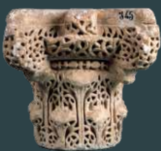
) Caliphate capital (10 th -11 th centuries)