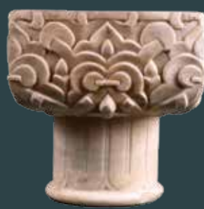
) Nasrid capital (14 th -15 th centuries)