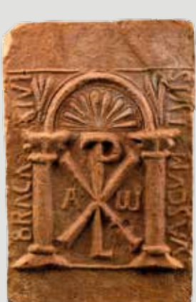
) Early Christian plaque with Chi Rho (5 th -7 th centuries)

The decline of the city and the exodus of the population to the countryside brought about the rise of the large landowner villae , centres of agricultural production of great economic importance. The scarce commercial exchanges now took place around Byzantium. As time passed, the current province of Granada formed part of the border ( limes ) between Visigoths and Byzantines, even ending up belonging to Justinian and Theodora's Spania in the 6 th century.