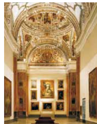
Former church of the Convent of La Merced

This room, the Convent's former church, is the grand backdrop for displaying the essence of the 17 th century Sevillian School of painting. Ranging from Mannerist formulas and an incipient Naturalism that begins with Roelas, it evolves toward the art work of Murillo, the greatest exponent of the Sevillian Baroque School of painting. Alonso Vázquez and Roelas embarked on the production of large paintings for altarpieces. In the second third of the century, Herrera the Elder, Zurbarán and Juan del Castillo continued this trend. This period is culminated by the paintings of Murillo for the Convent of Capuchinos. His well-known piece Virgin of the Napkin is among this ones.