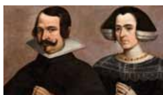
Old Lady and Gentleman praying. Francisco Pacheco

Naturalism emerges in Sevillian painting with artists such as Francisco Pacheco and his followers Diego Velázquez and Alonso Cano. Juan de Roelas's work is an approach to a mundane expressivity, where emotions, immediacy and stories take place.