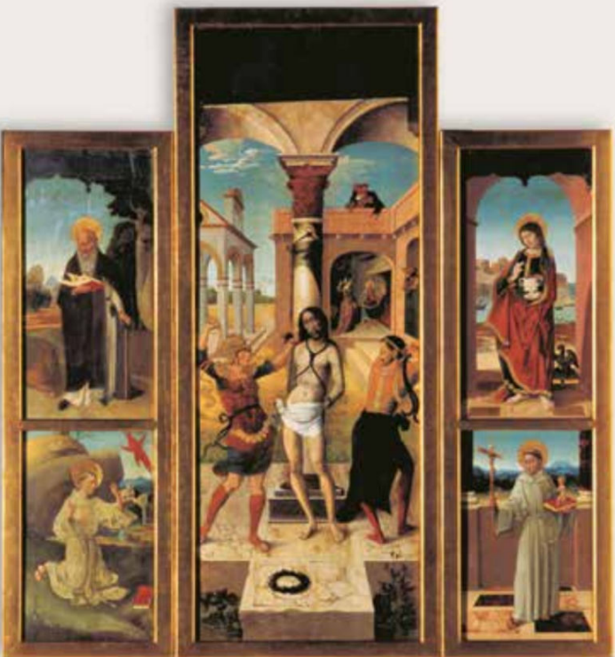
Altarpiece of the Flagellation Maestro del Retablo de la Flagelación