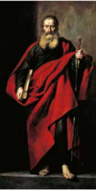
St Paul Antonio del Castillo Saavedra

Among his most notable disciples was Juan de Alfaro y Gámez, of whom the museum has received some interesting works in recent years and with whom the chapter of Cordoban naturalist Baroque is practically closed, until the appearance of Antonio Palomino y Velasco, also represented with various works. In addition, owing to their special links with the city, the museum also has works by Juan Antonio Escalante and Juan de Valdés Leal, normally exhibited next to the local artists who were their contemporaries.