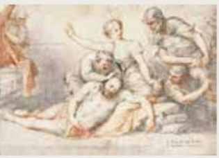
Samson and Delilah José de Ribera