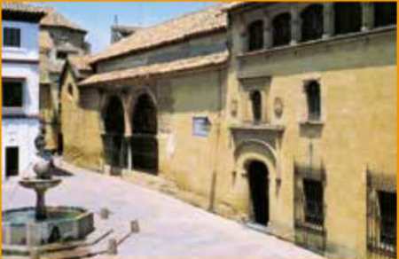
Main façade of the Museum of Fine Arts, Córdoba

The Museums of Andalusia, which the Ministry of Culture manages, form a network consisting of 23 institutions that differ widely from each other. the Museum of Almería, the Monumental Ensemble of La Alcazaba in Almería, the Andalusian Centre of Photography, the Museum of Cádiz, the Archaeological Ensemble of Baelo Claudia, the Archaeological Museum of Córdoba, the Museum of Fine Arts (Córdoba), the Archaeological Ensemble of Madinat al-Zahra, the Casa de Los Tiros Museum, the Museum of Fine Arts (Granada), the Museum of Huelva, the Museum of Jaén, the Archaeological Museum of Úbeda, the Museum of Arts and Traditions of the Upper Guadalquivir in Cazorla, the Archaeological Ensemble of Cástulo, the Museum of