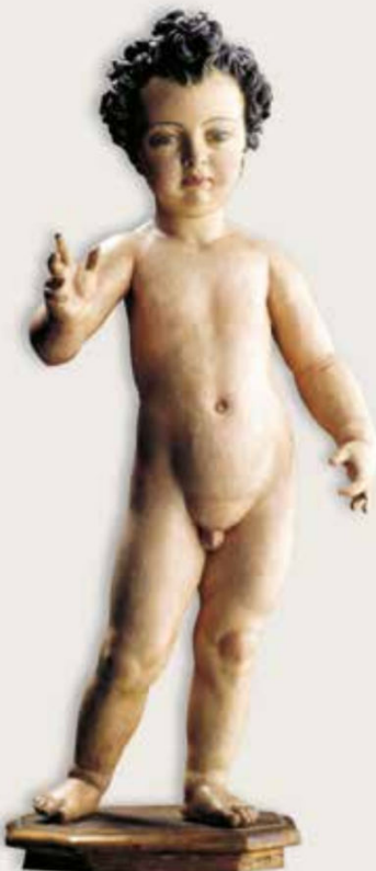
Child Jesus Juan de Mesa Velasco