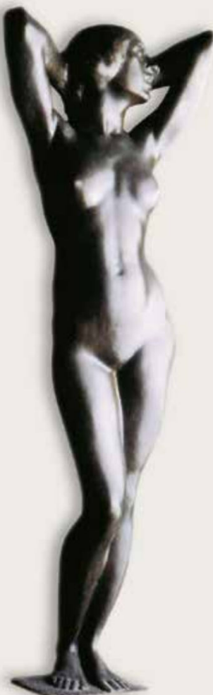
Desire Mateo Inurria Lainosa